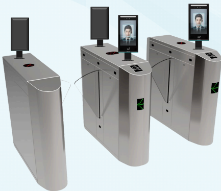
Two - Lane