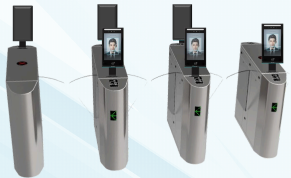
Three - Lane